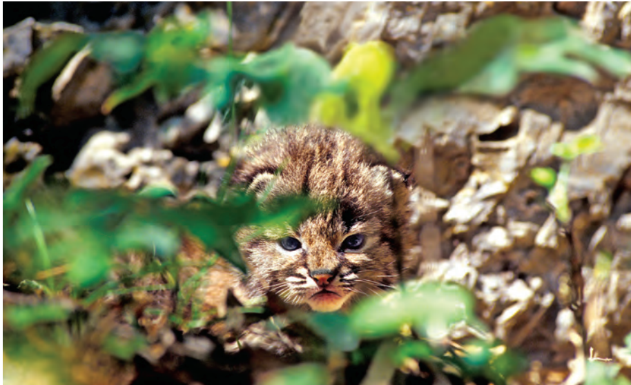
After their birth and weaning, bobcat kittens will stay with their mother from summer into early winter, learning hunting and survival skills.