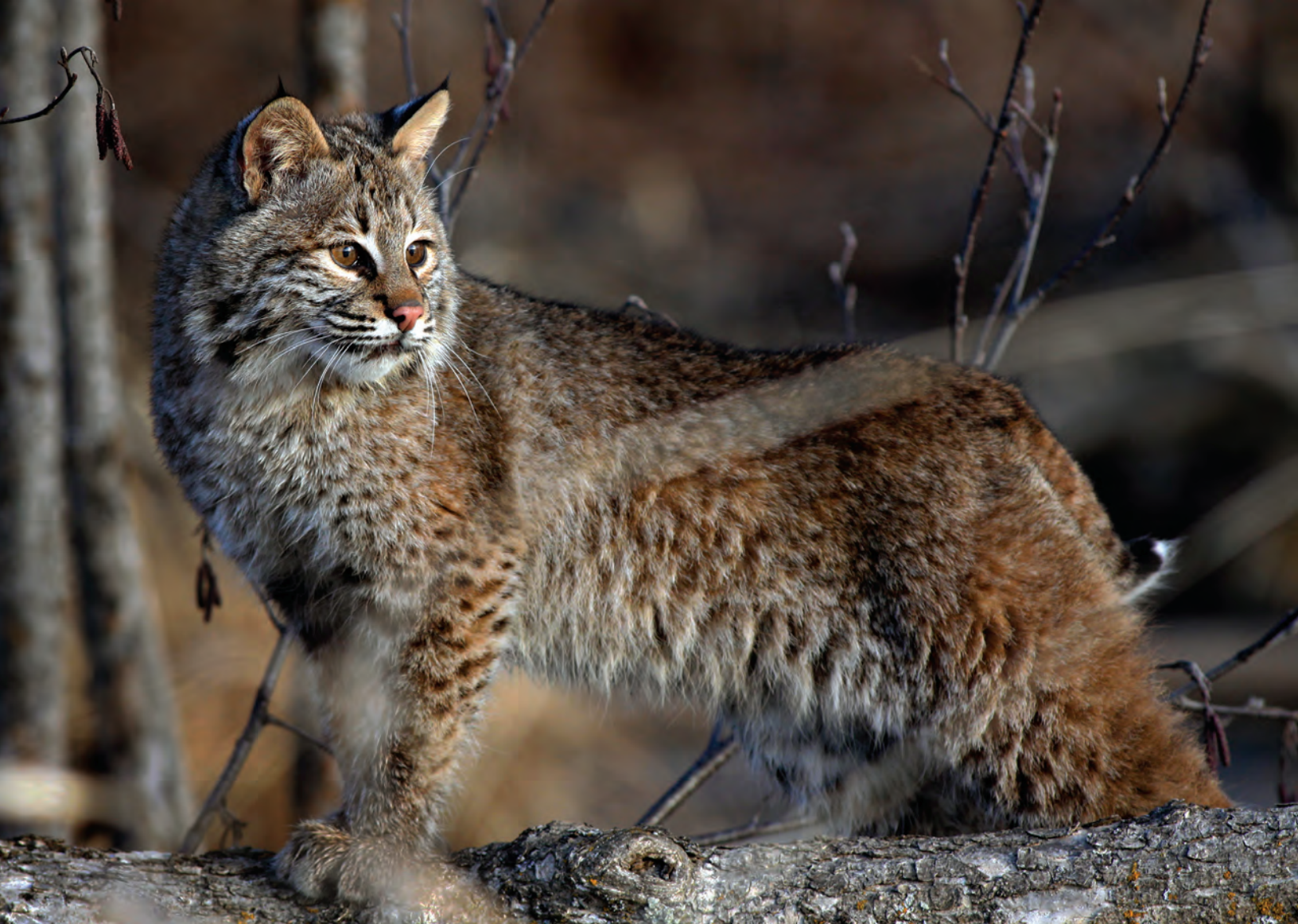
Vermont's bobcats are handsome animals, although their coats are less spotted in appearance than that of bobcats from western and southeastern states.