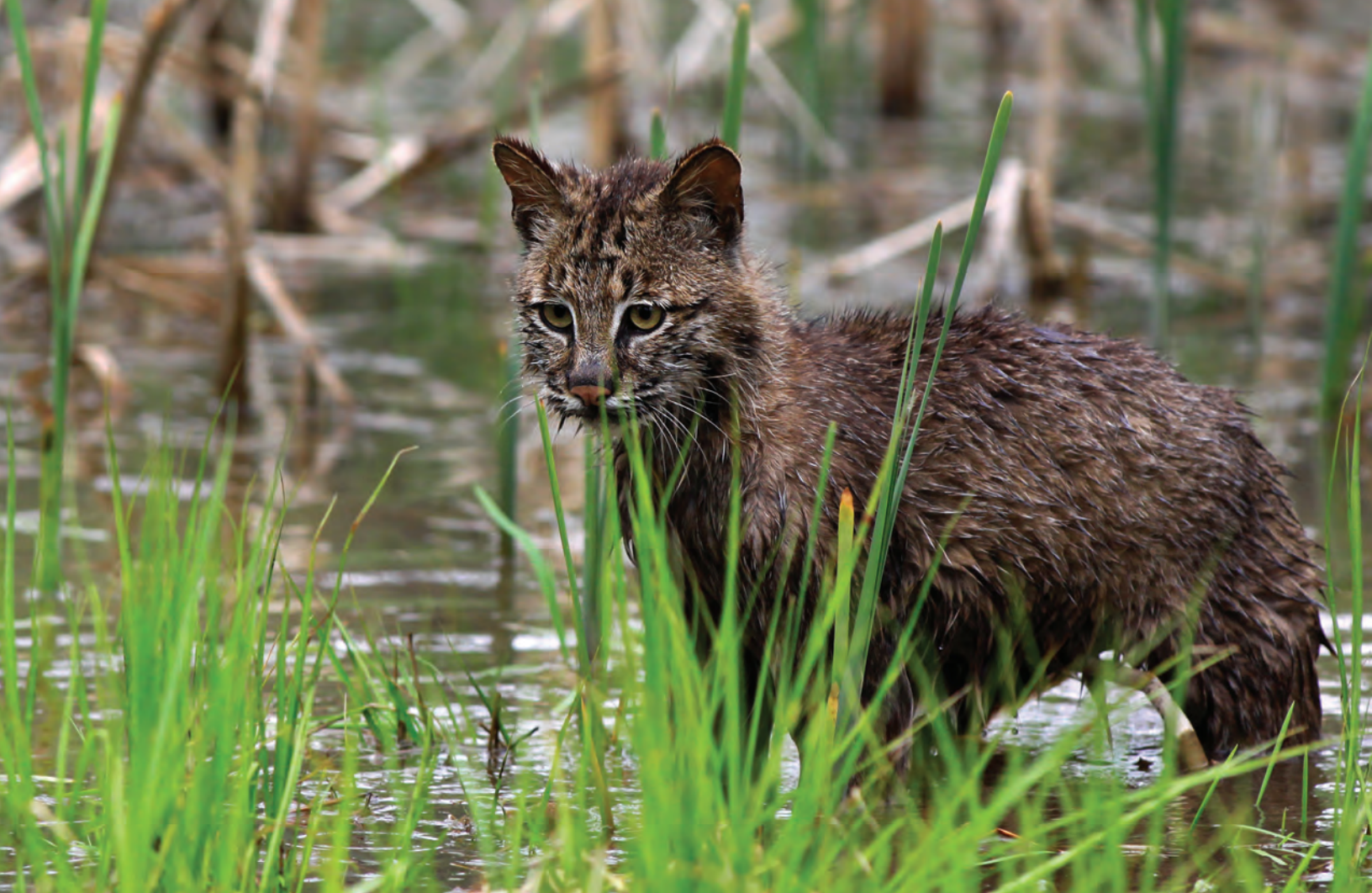
A very determined and wet-looking muskrat hunter, hard at work.