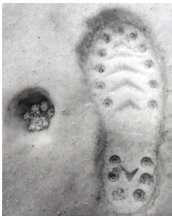
At left, clear tracks of the largest tom bobcat Sue monitored (for 11 years) back in the 1980s. Above, tracks next to Sue's boot print; there is some fresh graupel (pellet) snow in the track.