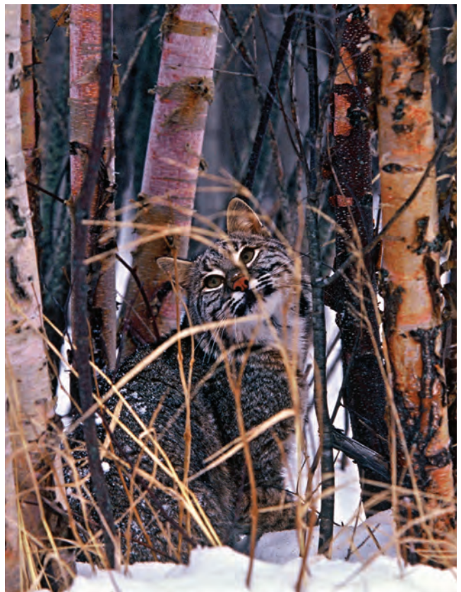
A young bobcat stalking grouse. A stealthy approach usually will bring a bobcat close enough to pounce on its prey.