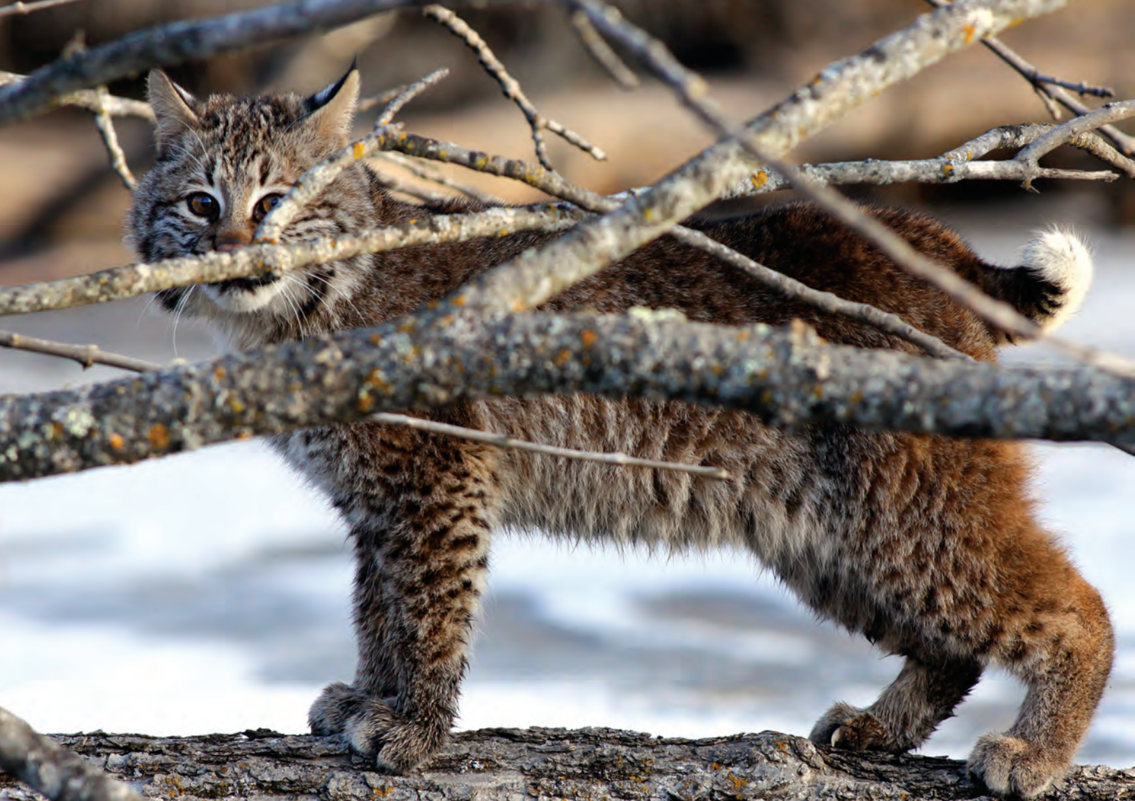
Unlike its cousin, the Canada lynx, the bobcat has a short tail that is noticeably white underneath, and its feet are much smaller.