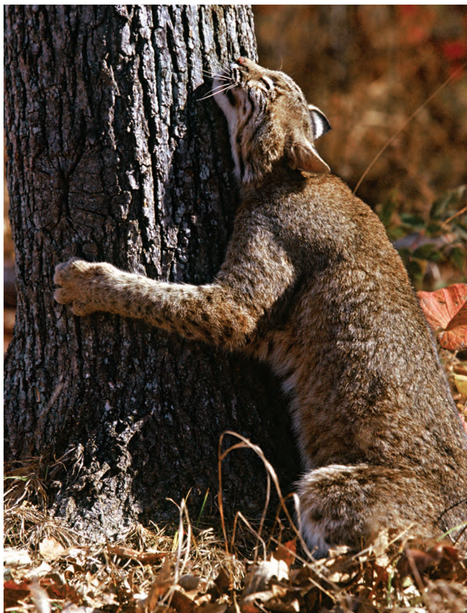
Bobcats will often leave scat at scent posts; this dreamy-eyed tom is instead scent-marking a tree using glands around its mouth.

farmland was growing up into brush and young trees, creating great habitat for prey animals such as hare. With the reintroduction of fisher, movement of coyotes into the state, and the maturation of forests, the bobcat population declined. Now bobcats seem to have adjusted to the competition and changes in prey, and their population has increased in the past decade. Recent warmer winters have made it easier for these cats, as the cold and deep snow are hard for them.