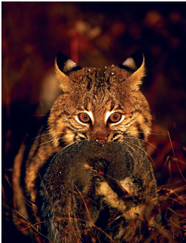
A defensive-looking squirrel hunter, proudly carrying away its prey.