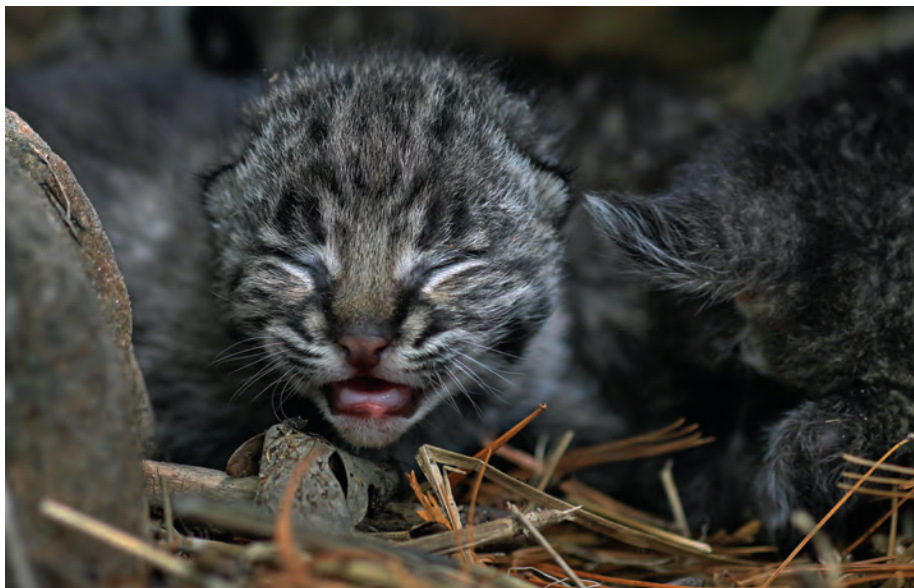
A bobcat kitten. Bobcats mate in late March or early April and kittens are born in late May or early June.